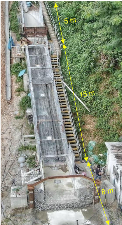
Figure 2. The 28 m-long field-scale flume in Hong Kong, China.

Figure 2 shows the 28-m-long field-scale flume model was developed and built at the Kadoorie Centre of The University of Hong Kong. This flume is used to model debris flows impacting on rigid and flexible barriers and, more recently, has also focused on replicating debris flows on an erodible bed impacting on barriers. The steel flume has a uniform cross-section with a width of 2 m and a depth of 1 m. The storage container inclines at 30°, is 5 m in length, and can store up to 10 m 3 of material. The main transportation channel is 15 m long and has an inclination of 20° with a transparent side wall. The downstream section is horizontal and 8 m in length.